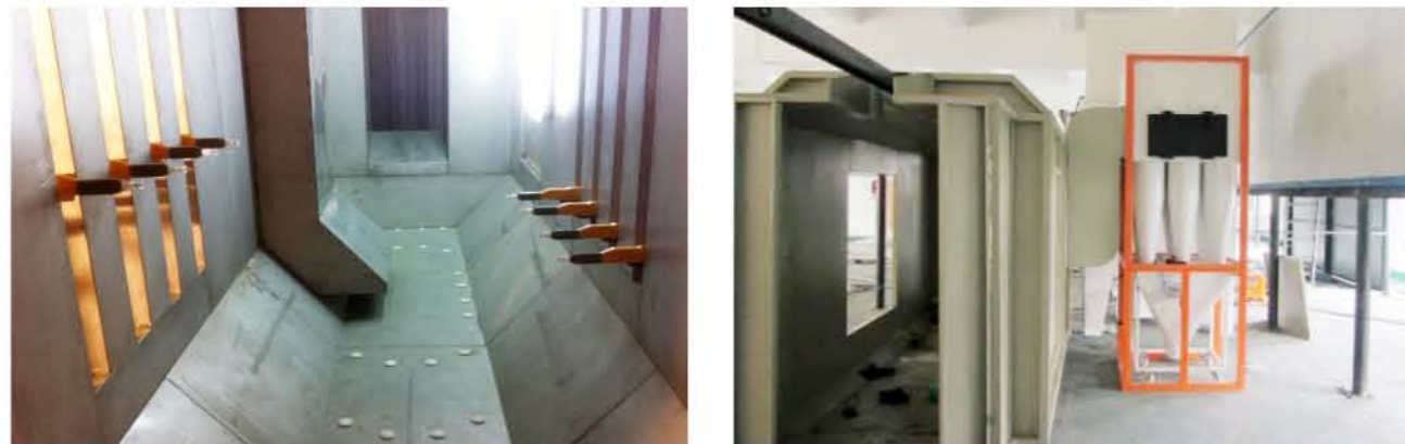
inside of powder spray booth