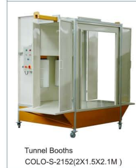
Tunnel Booths COLO-S-2152(2X1.5X2.1M )